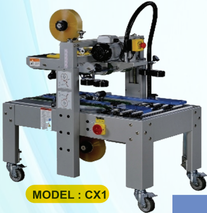
MODEL : CX1