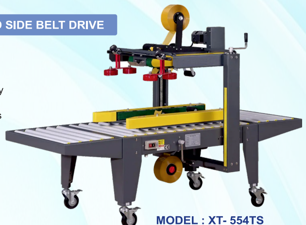
MODEL : XT- 554TS