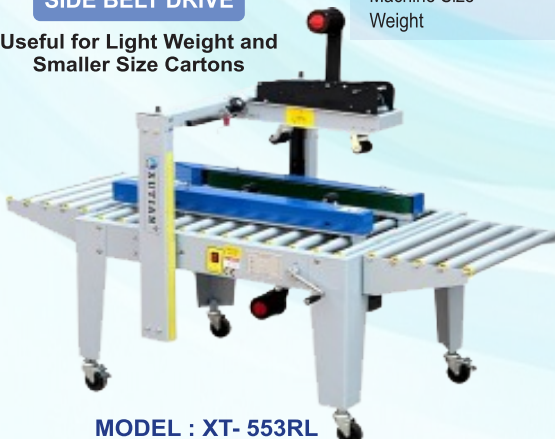
MODEL : XT- 553RL

Useful for Light Weight and Smaller Size Cartons