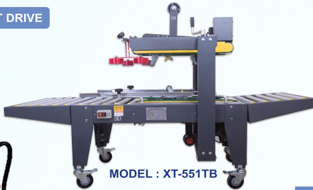
MODEL : XT-551TB